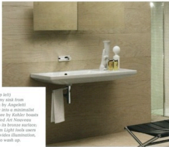
(Clockwise from top left) The sleek and skinny sink from the Thin Collection by Angeletti Ruzza fits perfectly into a minimalist bathroom; Lilies Lore by Kohler boasts a beautifully detailed Art Nouveau pattern etched into its bronze surface; while the Art Ceram Light fools users into thinking it provides illumination, instead of a place to wash up.