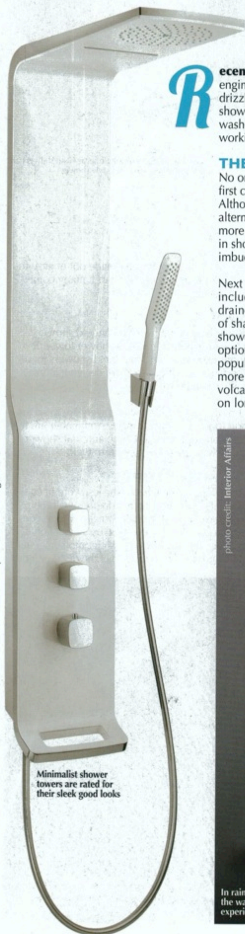
Minimalist shower towers are rated for their sleek good looks

R ecent collaborative leaps in bathroom technology, engineering and design mean an end to enduring a tepid drizzle in a lime-scaled shower stall. Today's va va voom showers score high for both form and function, redefining washing as a sensory experience. The only tricky bit is working out what you want from all the choices on offer.