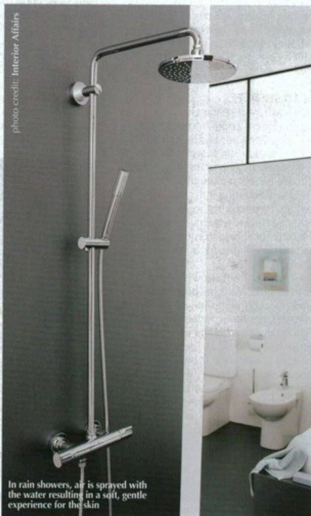
In rain showers, air is sprayed with the water resulting in a soft, gentle experience for the skin